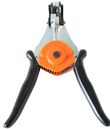
Pic. 1 Jacket stripper