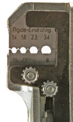
Pic. 2 Cavities