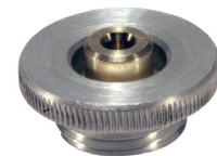
Adapter fiber end sleeve