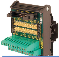
PRESENTATION PURPOSE ONLY